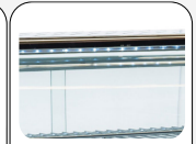
Inner LED light