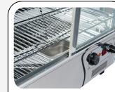
Stainless steel basement