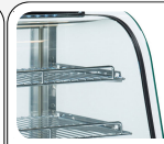
Double glass to reduce dispersion